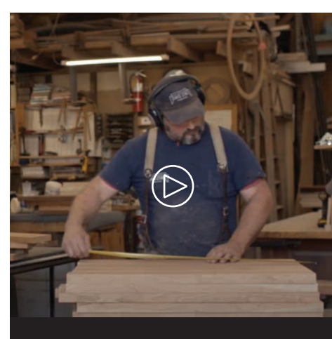
CLICK HERE TO WATCH OUR BRAND REEL

His award-winning work has been featured in: The Chicago Tribune Cottages & Bungalows Design STL Dwell Fine Woodworking Forbes Life Midwest Living Mountain Living The Robb Report St. Louis Business Journal St. Louis Magazine St. Louis Post-Dispatch