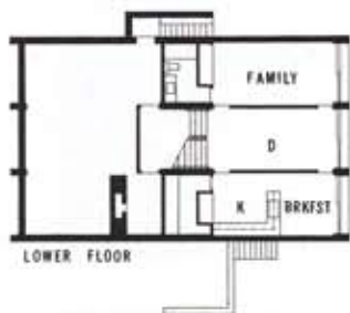
◀ The original plans of the house. ▶